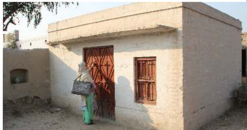
Kubra Bibi, Lady Health Worker (LHW), District Lodhran, Punjab

only one household refused polio vaccination compared to the previous 33%. The ratio of deliveries with a Skilled Birth Attendant (SBA) has also increased from an average of 8 per month to 25 per month.”