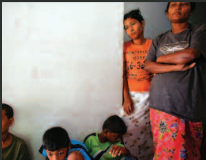
Rohingya women and children who arrived by boat from Burma pass the time at a closed shelter in Phang Nga, Thailand, in October 2013.

Children should not lose any of their childhood in immigration detention. Alternatives to detention exist and are used effectively in other countries, such as open reception centers and conditional release programs. Such programs, generally a cheaper option, respect children’s rights and protect their future. Given the serious risks of permanent harm from depriving children of liberty, Thailand should immediately cease detention of children because of their immigration status.