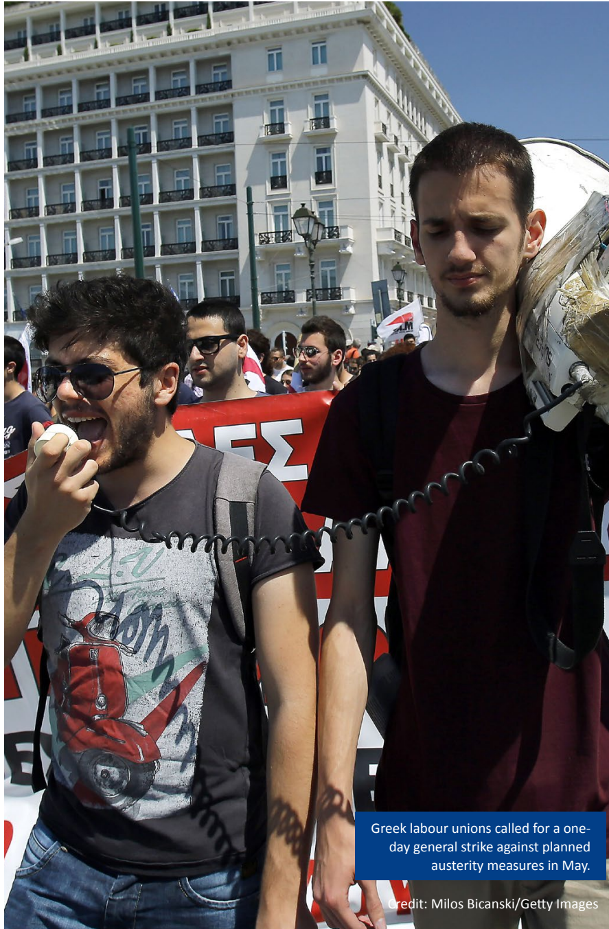
Greek labour unions called for a one-day general strike against planned austerity measures in May.