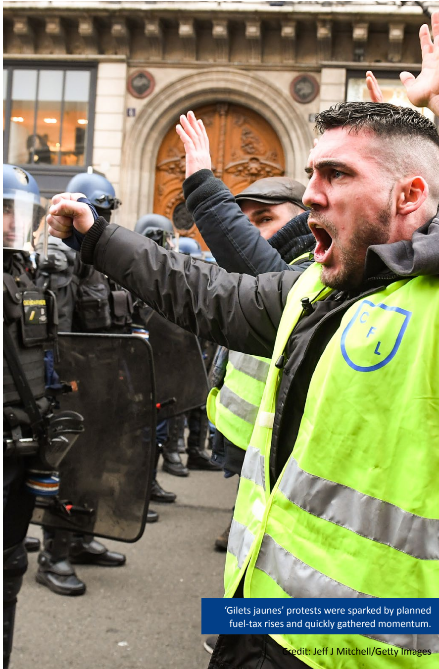
'Gilets jaunes' protests were sparked by planned fuel-tax rises and quickly gathered momentum.