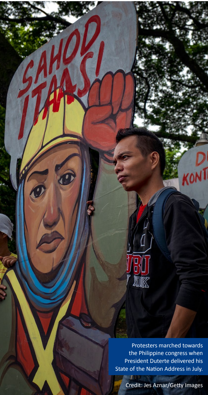
Protesters marched towards the Philippine congress when President Duterte delivered his State of the Nation Address in July.