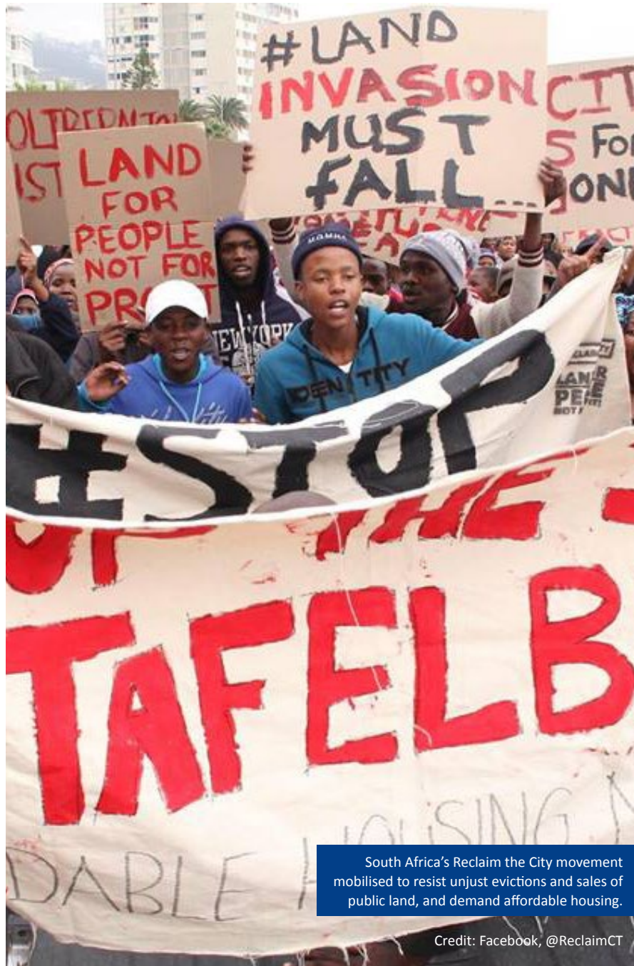
South Africa's Reclaim the City movement mobilised to resist unjust evictions and sales of public land, and demand affordable housing.