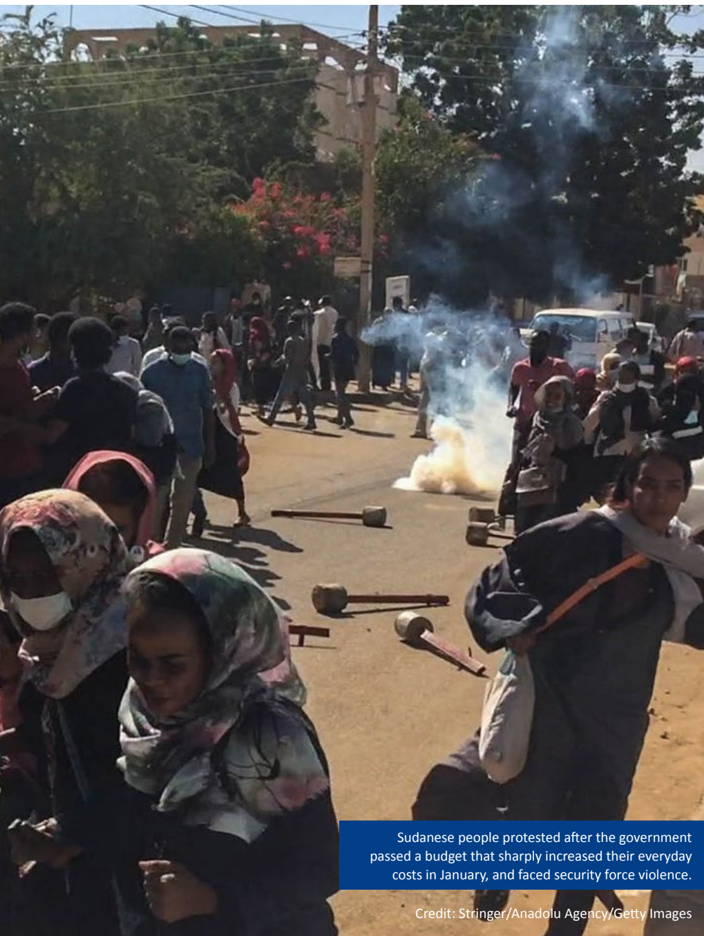
Sudanese people protested after the government passed a budget that sharply increased their everyday costs in January, and faced security force violence.