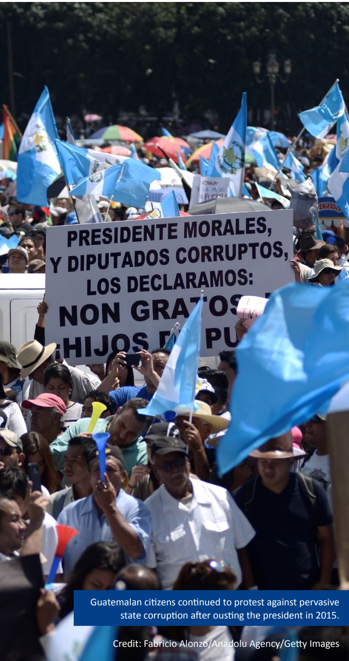
Guatemalan citizens continued to protest against pervasive state corruption after ousting the president in 2015.