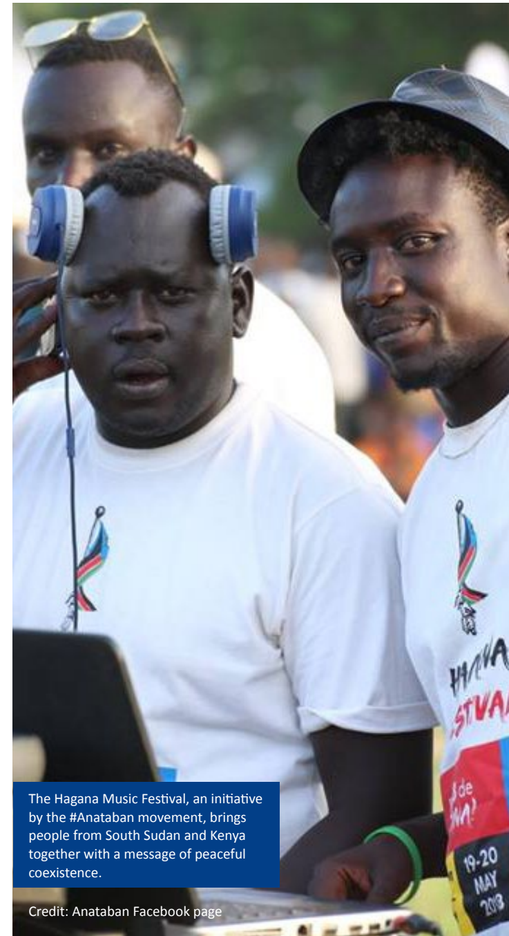
The Hagana Music Festival, an initiative by the #Anataban movement, brings people from South Sudan and Kenya together with a message of peaceful coexistence.

Foremost on the agenda should be finding a solution to the severe political crisis that has persevered for several years. Efforts by President al-Bashir and his ruling party have lacked