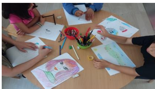
Child Friendly Space in Bihać Center, BiH

Save the Children began working with LAN in 2018, supporting in organizational capacity development, including capacity building of staff, which were only 5 at the time.