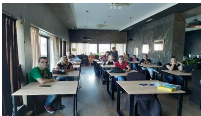
Capacity Building of LAN staff