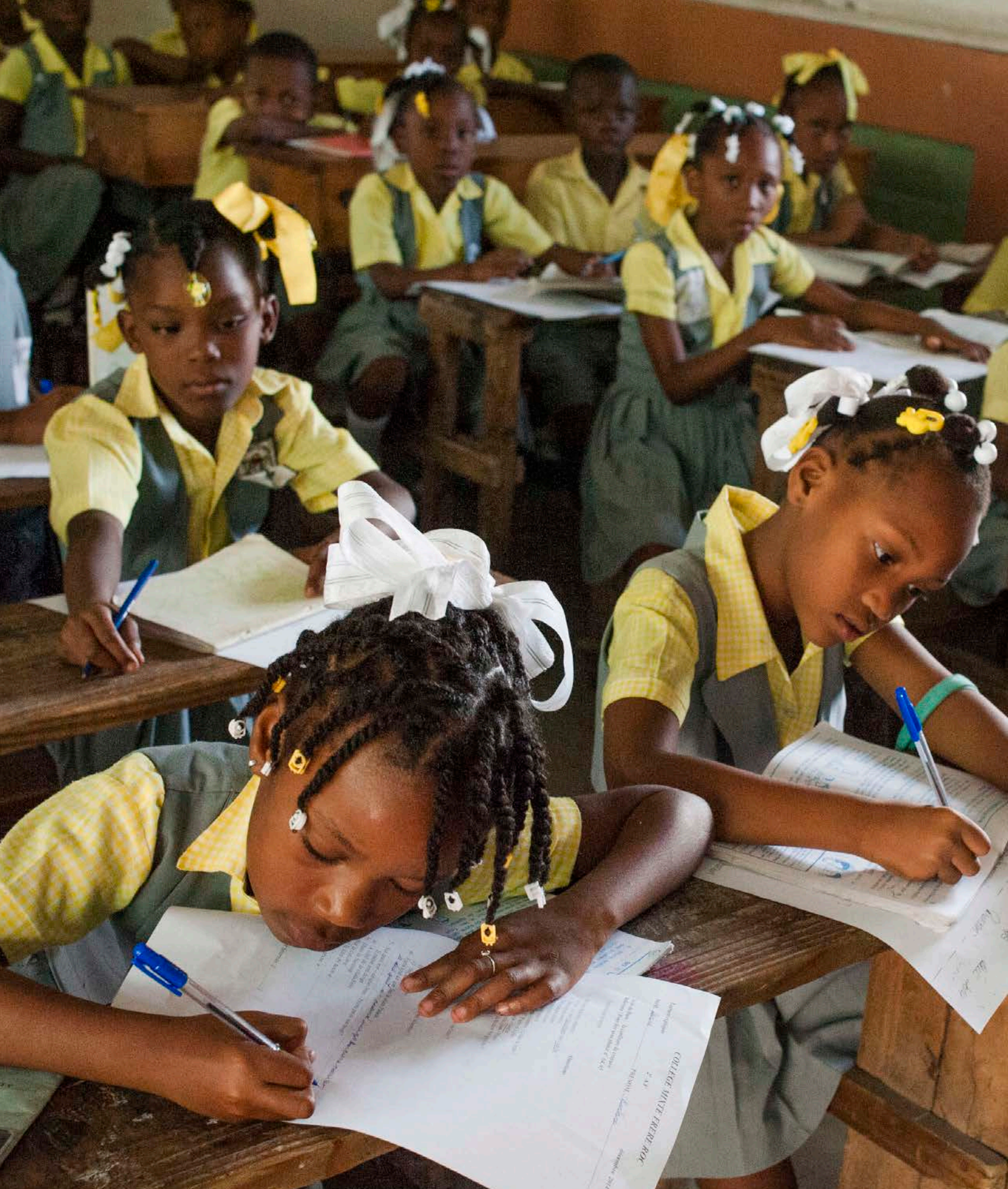
Children sit exams at a Save the Children supported school in the Port-au-Prince metropolitan area.