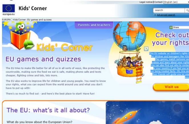
Figure 9.1 Screen shot from Kids Corner website

A part of the portal is the website on the rights of the child, with content split into age categories for the 0-12 and 13-18 age groups, for which they have received positive feedback from child participation academics and from children themselves. The website also included some child-friendly summaries of EU legislation. An EU stakeholder commented that some of the child friendly content on such sites has been too static and has not been updated on a regular basis, and that whilst the intentions were positive, the content was too general to meaningfully engage children. It was