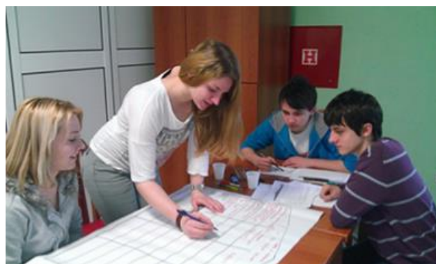
Figure 7.1 Young researchers planning the research in Croatia

Overall, the child peer researchers had a significant degree of involvement in, and responsibility for, all aspects of a project, from overall research design, to developing research questions, data collection, analysis, reporting and dissemination. However the extent of their involvement varied between projects, depending on factors such as the ages and backgrounds of the children, the timing of projects in the school year, and the precise research tools identified for each project.