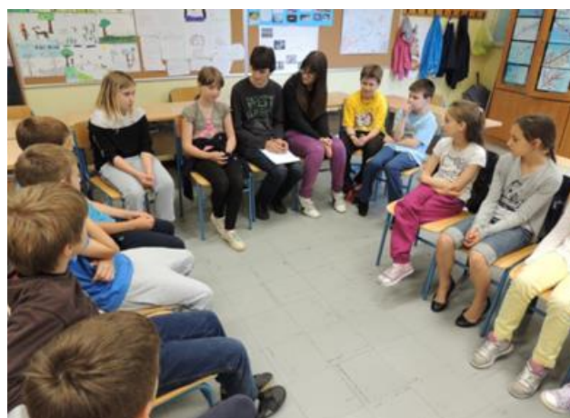
Figure 7.4 Young researchers conducting a focus group with elementary school children, Opatija, Croatia

One of the researchers from the Black Young Carers project in the UK also identified that taking part in the project had strengthened their desire to campaign on the issues they cared about: 'I now have fire in my belly to get out there and get young carers' voices heard and work to get young carers who don't realise they are young carers to get their voices heard as well' .