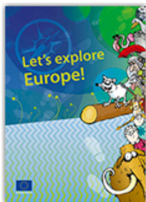
Figure 9.2 Examples of publications targeted at children

Produced by the Directorate-General for Communication (COMM), the Let's Explore Europe booklet is aimed at 9 to 12 year olds, gives an overview of Europe and explains briefly what the European Union is and how it works. It is available as an online publication and in hard copy.