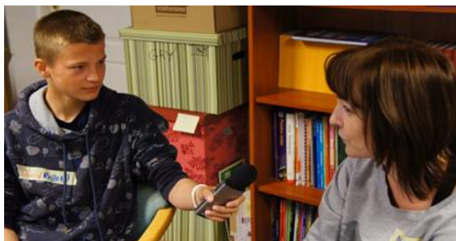
Figure 7.3 Young researcher from SOS Children's Villages in Poland

Many of the children commented on their development of research skills. Another child from SOS Children's Villages in Poland stated 'I got to know something new about carrying out an interview. And I worked with a dictaphone' . She also reflected on the fact that 'sometimes the issues were difficult to discuss' , but that she 'could help my peers solve some difficult problems' .