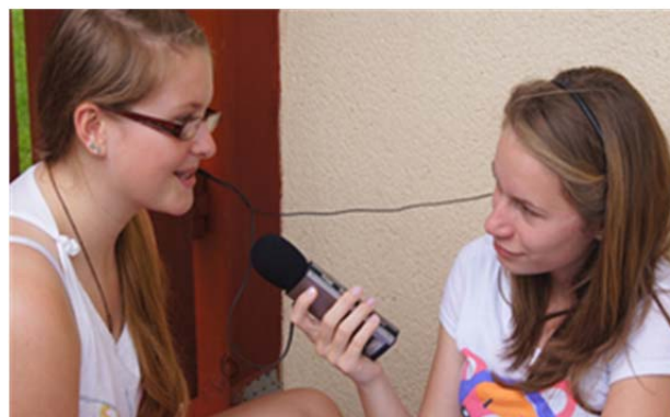
Figure 7.2 Peer research in progress in Poland