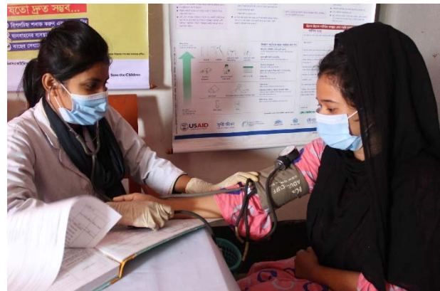
Midwife providing ANC services.

When USAID’s MaMoni MNCSP started to work at Faridpur district in Bangladesh in 2018 this was the badly situation for mothers to conduct facility delivery. Most of the delivery has been conducted with unskilled Traditional Birth Attendant (TBA) at home and there was no opportunity to manage any complications of mothers and newborn. The project along with health and family planning department as well as union parishad (Local Government) made assessment the need and opportunity for the 15,000 population to set up a facility delivery service centre with general patient treatment and family planning services. All the government department and MaMoni MNCSP realized the desperate need of a facility delivery centre what can save hundreds of mothers and newborn lives.