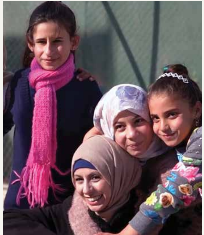
Photo: TIGER Girls is a community-centered empowerment programme for adolescent girls with the goals to decrease the dropout rate and encourage team-supported, active, solutions-based learning.

The Planet Learning system enables periodic exchanges to occur between online national centers and individual communities that are primarily offline. Data, by gender and role, includes frequency of sign-ins, number of resources downloads, number of courses/career pathways certifications, pre-and post-assessments and periodic surveys. Key findings from an objective report by the Harvard Graduate School of Education on the TIGER program include: 1) it helps girls stay in school, 2) safety was a major concern of the girls, 3) most girls have developed a strong desire to learn and are more optimistic about their futures.