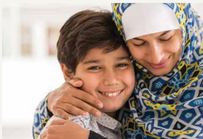
Photo: Read to Kids aims to mitigate the effects of toxic stress on children through shared reading activities with parents.

A key challenge and cost is the promotion of the application by the project and partner organisations to increase the reach and discoverability of the application. Other costs when scaling up could include the addition of new and relevant content for cultural and linguistic groups, app development/improvements and regular training to new partners on how to integrate the tool into their work. Notifications for new user groups and data reports and analysis for partners.