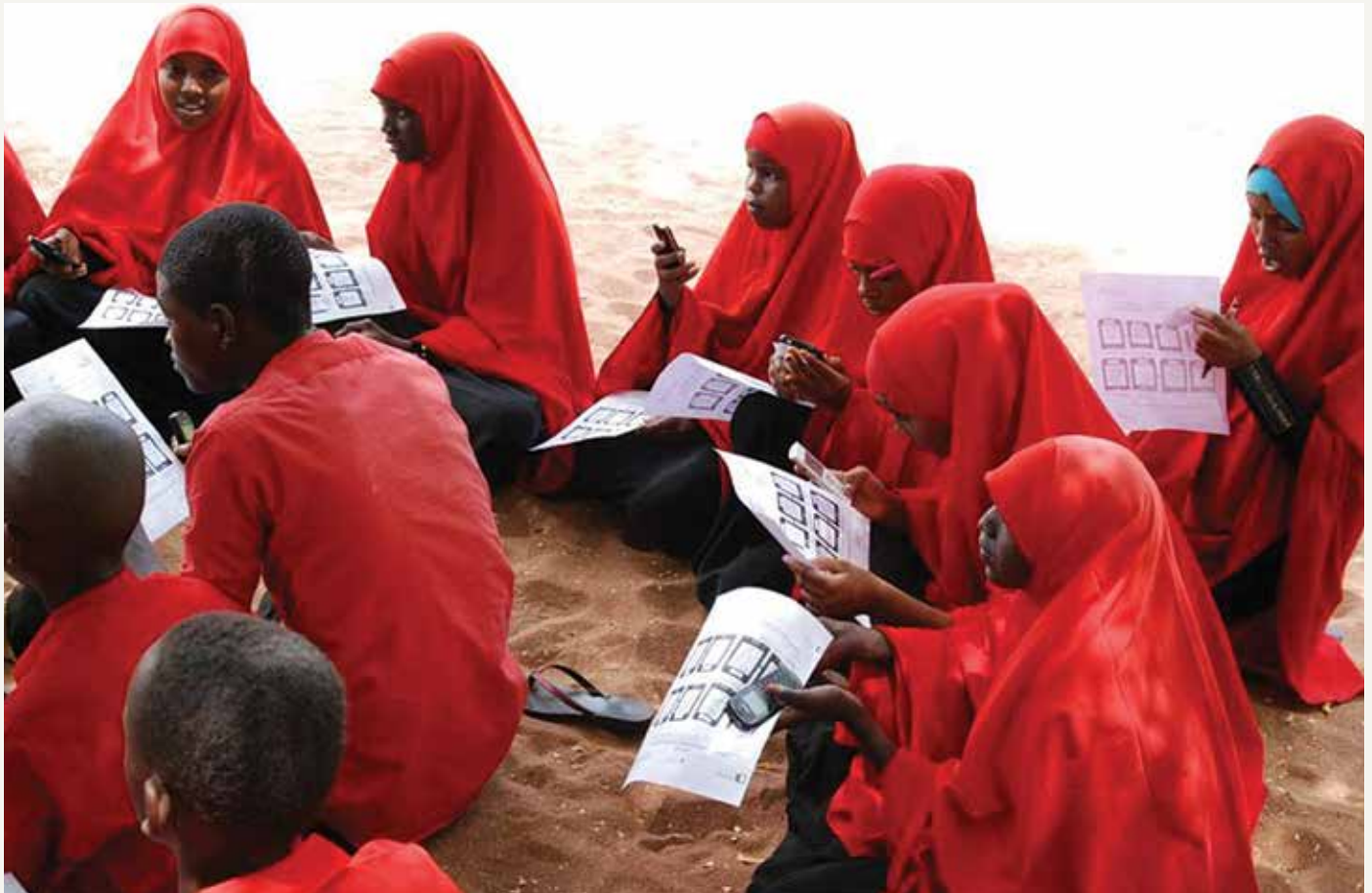
Photo: Refugee girls in Kenya, use the Eneza SMS study tool to access education

Many teachers in refugee camp settings are untrained and must cope with class sizes of up to 200 students. It is almost impossible to effectively set and mark written homework in these settings, at least not on a regular basis. Eneza enables teachers to set homework on the Eneza handsets, which is then marked by the system. They get the results the next day from the dashboard. While not a replacement for personalised marking, it means homework can be set on a regular basis. Eneza also has a course for teachers which helps with classroom management and other areas of basic pedagogy.