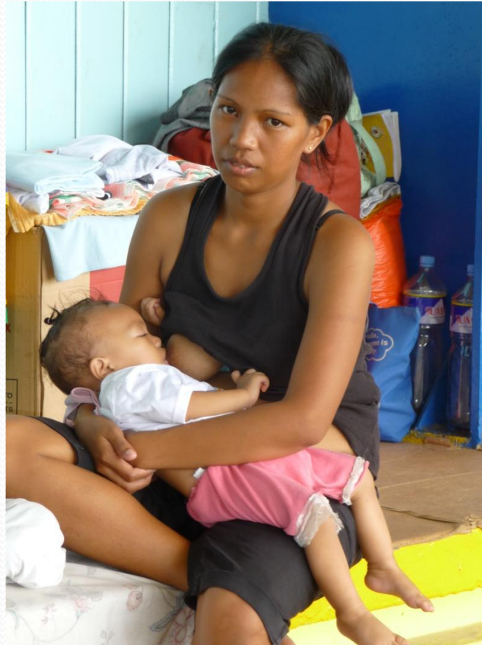
Philippines, 2010