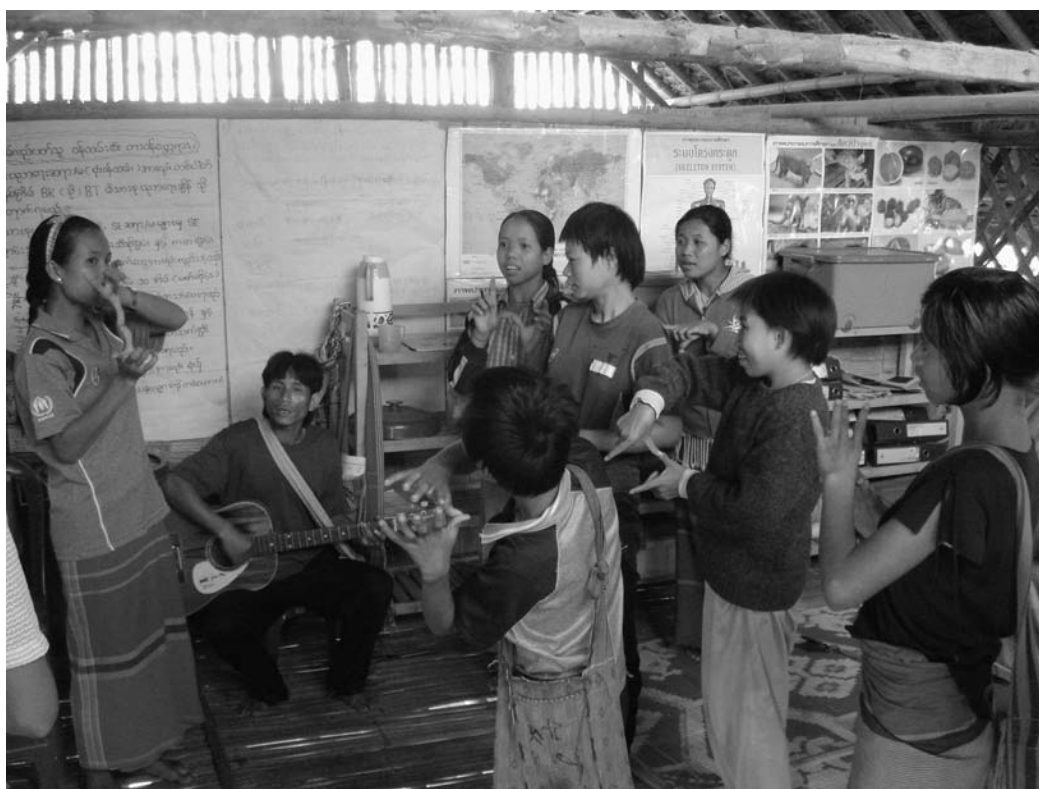
Deaf refugee children from Burma learn to sign in Thailand.

goal of integrating students into mainstream schools at the secondary level. A significant development in the refugee camps has been the documentation of Karen sign language and the dissemination of Karen Braille, which had already been created in Myanmar (formerly, Burma).