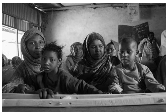
Local NGO CCBRS, Comprehensive Community Based Rehabilitation Somaliland, in partnership with UNHCR, provides physical therapy to the disabled as well as sexual and gender-based violence counseling in Hargeisa IDP settlement, Somalia.

The IASC Guidelines on Mental Health and Psychosocial Support in Emergency Settings provide a framework for understanding mental health and psychosocial problems in emergencies that is also useful when applied to persons with disabilities. 65 The guidelines state that mental health and psychosocial problems may be predominantly social or psychological in nature. Social problems may have existed before the emergency (e.g., poverty; preexisting discrimination and social exclusion). They may be emergency induced (e.g., family separation; disruption of social networks and community structures; gender-based violence) or humanitarian aid induced (e.g., undermining of community structures or traditional support mechanisms). Problems that are predominantly psychological follow the same model. They may be preexisting (e.g., severe mental disorder), emergency induced (e.g., depression and anxiety disorders, including post-traumatic stress disorder and grief) or humanitarian aid induced (e.g., anxiety due to lack of information about food distribution). The IASC Guidelines on Mental Health and Psychosocial Support identify people in the community with preexisting severe physical, neurological or mental disabilities or disorders as a subgroup that could be at increased risk of developing mental health problems in an emergency. Other at-risk groups include elderly people, especially those who have lost caregivers; people in