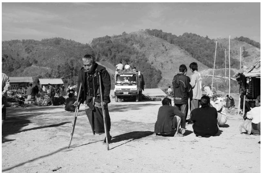
Refugees from Myanmar (Burma) at Umpien Refugee Camp, Thailand.

Almost all the refugee situations surveyed identified problems with the physical layout and infrastructure of the refugee camps or settlements, and lack of physical access for persons with disabilities. In refugee camps, refugees with disabilities noted the physical inaccessibility of shelters, food distribution points, water points, latrines and bathing areas, schools, health centers, camp offices and