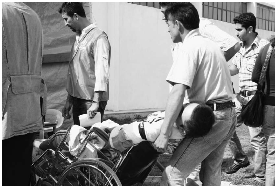
UNHCR has a dedicated registration center for Iraqi refugees located in Douma, 25 km from Damascus, Syria. A refugee injured in the war waiting at the registration center in order to receive an interview appointment.