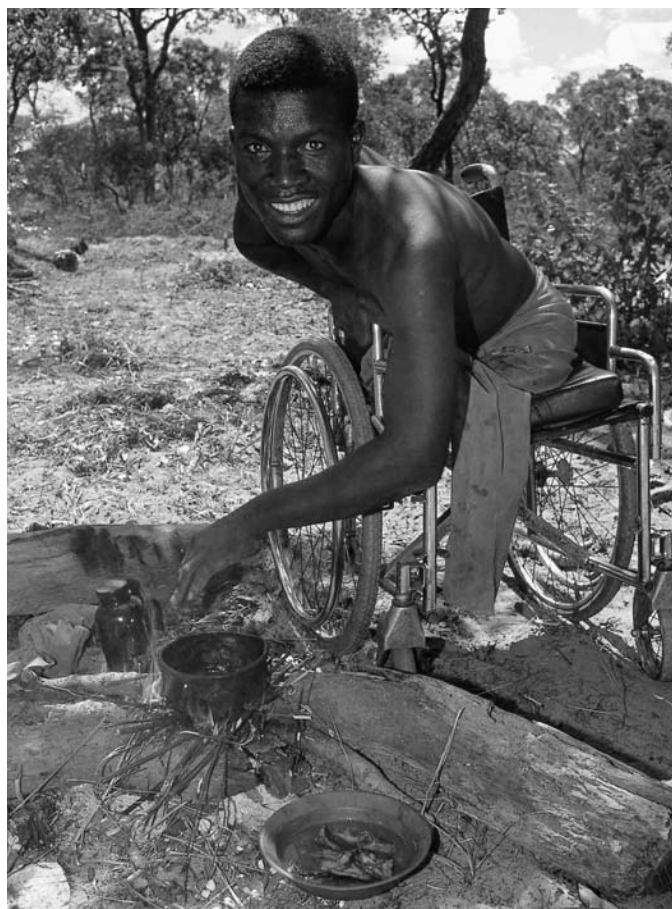
Disabled Angolan refugee in Nangweshi Camp, Zambia.

A positive example of taking the needs of persons with disabilities into account in food and nonfood distribution systems can be found in Dadaab, Kenya, where UNHCR reached an agreement with WFP that