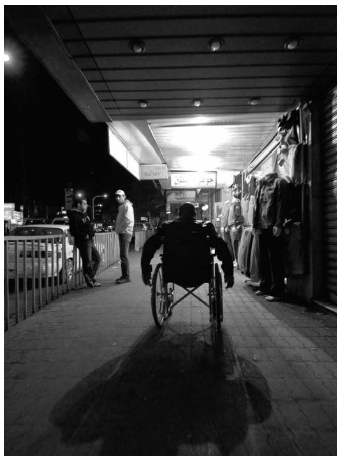
Disabled Iraqi veteran of the Iran/Iraq war in Amman, Jordan.

According to information from UNHCR, Dadaab is located in a river delta with very sandy ground. This makes it especially difficult for refugees with physical disabilities and those reliant on wheelchairs to move around the camps. In response to this challenge,