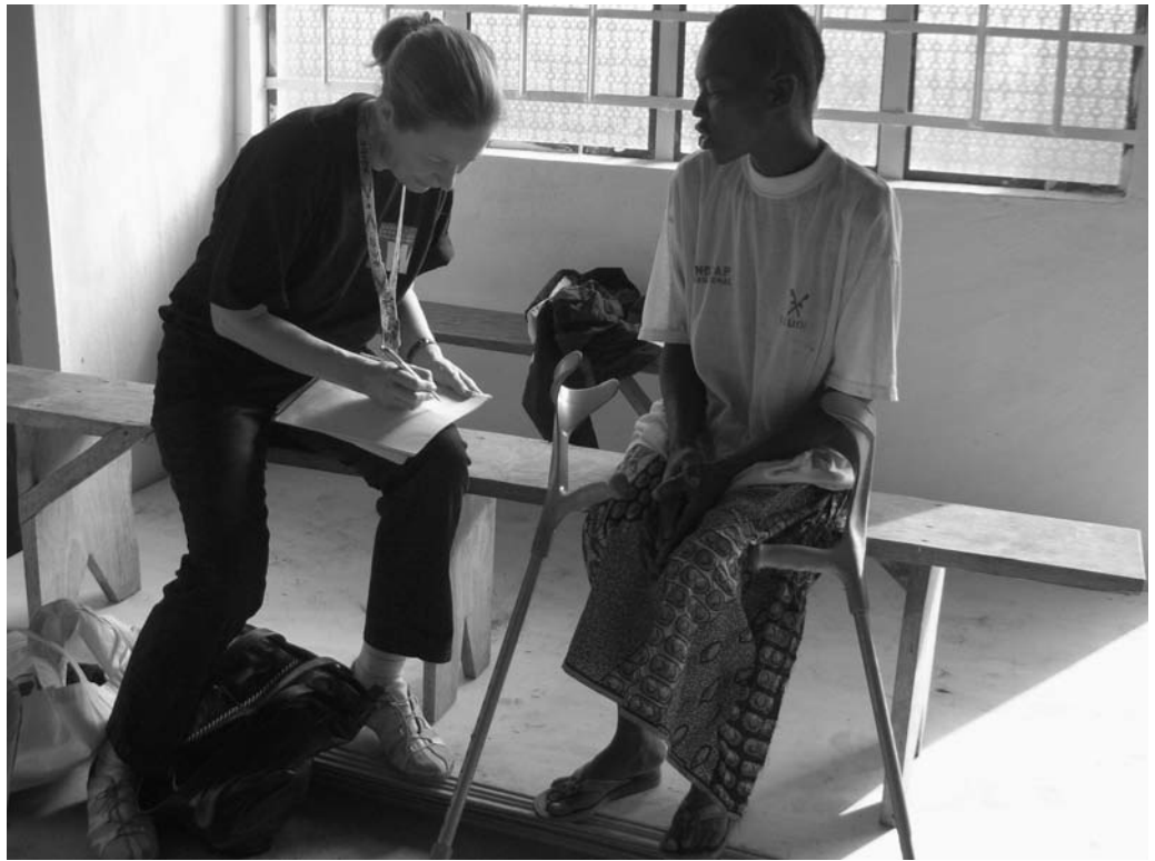
A girl who was disabled by the war in Sierra Leone meets with the Women's Commission.

community affairs and activities. Often mothers abandoned by their husbands and families and left alone with children with mental disabilities felt that they had no choice but to tie up their children if they wanted to leave their house for any reason. Although children with mental disabilities were able to attend school, they were much more likely to be ignored and neglected and not receive the support and assistance they needed. The priority, according to UNHCR, was to address negative attitudes toward people with mental disabilities through community awareness raising and public information programs. 40