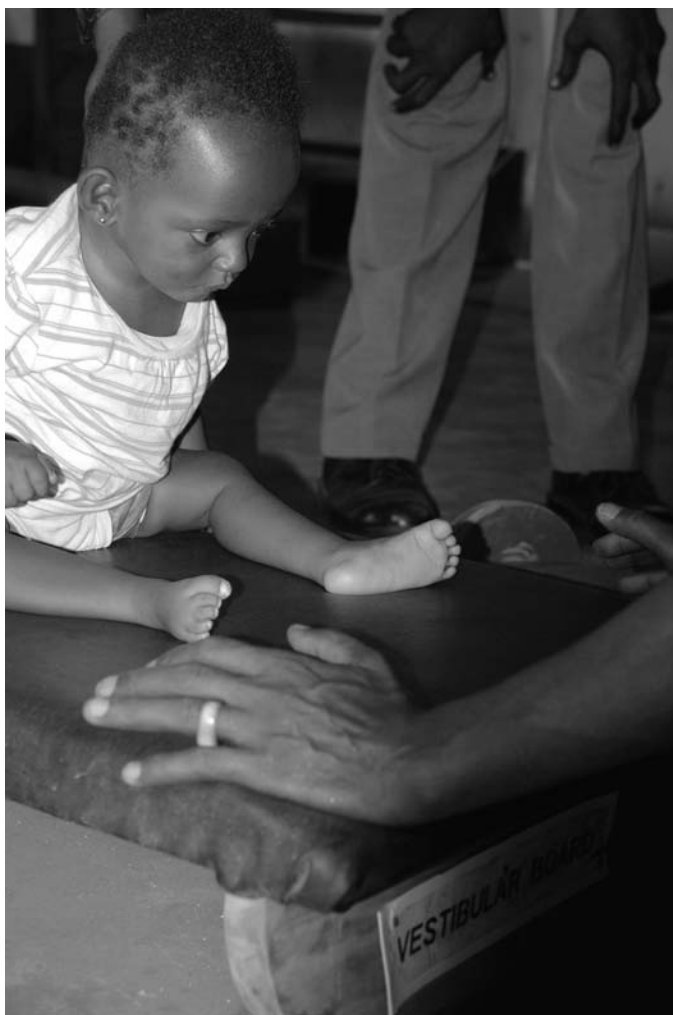
Child being treated at International Rescue Committee Physical Therapy Unit, Kakuma Camp, Kenya.

to be involved in camp management structures, even in those places where there were high levels of disability awareness.