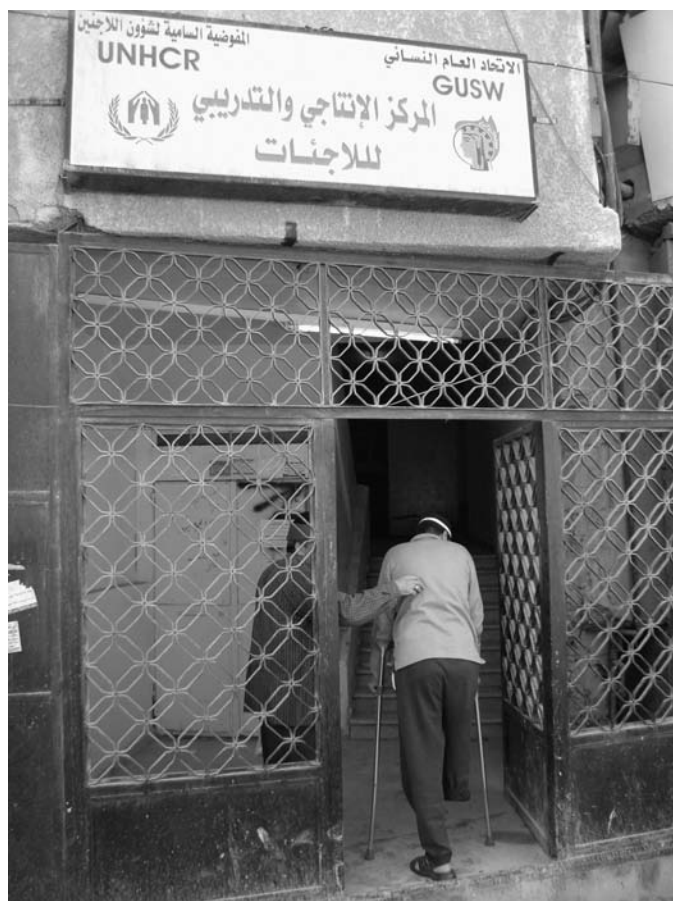
A disabled Iraqi man entering a vocational training center funded by UNHCR in Damascus, Syria.

In some countries, UNHCR, the government and partner organizations have coordinated effectively to gather data on the number and profile of refugees with disabilities in the camps. A comprehensive data collection exercise was carried out in the Dadaab refugee camps in September 2007, for example, providing very detailed information on the numbers and types of disabilities in the camps and on the immediate needs of people living with disabilities. 44