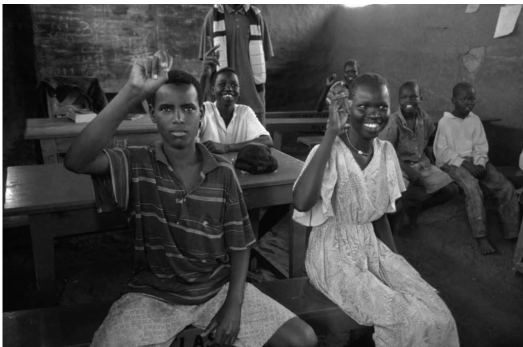
Sudanese refugees in Kakuma Camp, Kenya, attend a class for deaf children using sign language.

opportunities to find employment or set up their own small businesses.