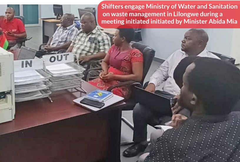
Shifters engage Ministry of Water and Sanitation on waste management in Lilongwe during a meeting initiated by Minister Abida Mia